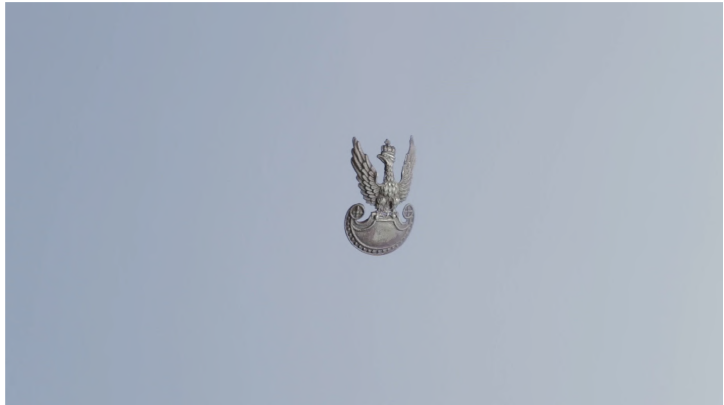
Orzełek, 2018, still from the video, 00:13:12 (loop), https://vimeo.com/272346285

Many of the Łomża eagles were created as replicas or interpretations of earlier, iconic designs, raising questions about authenticity and the transmission of cultural heritage.