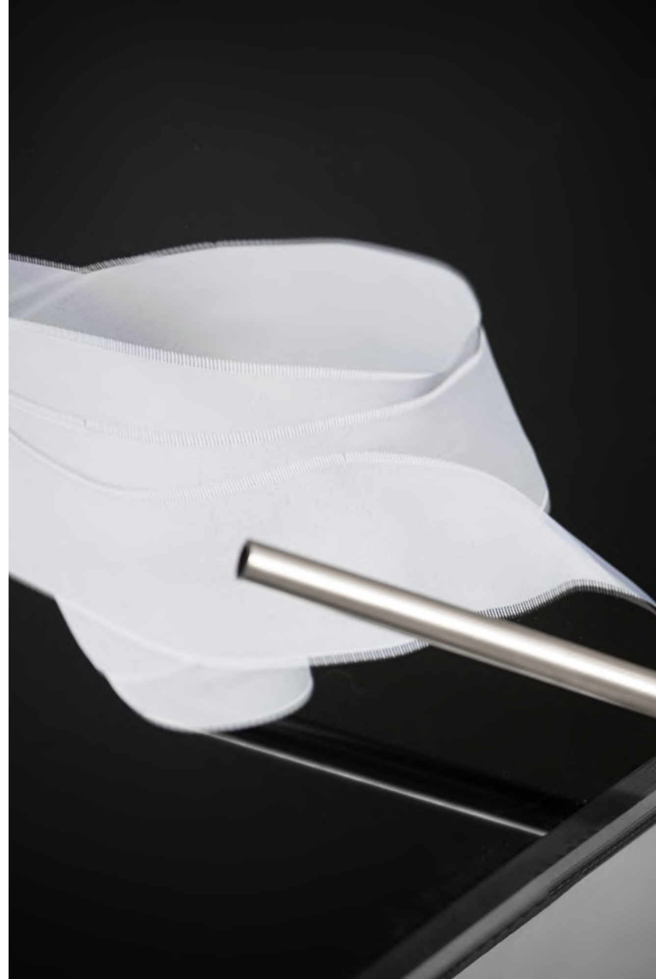
Open studios at Künstlerhaus Bethanien, 2024, exhibition view