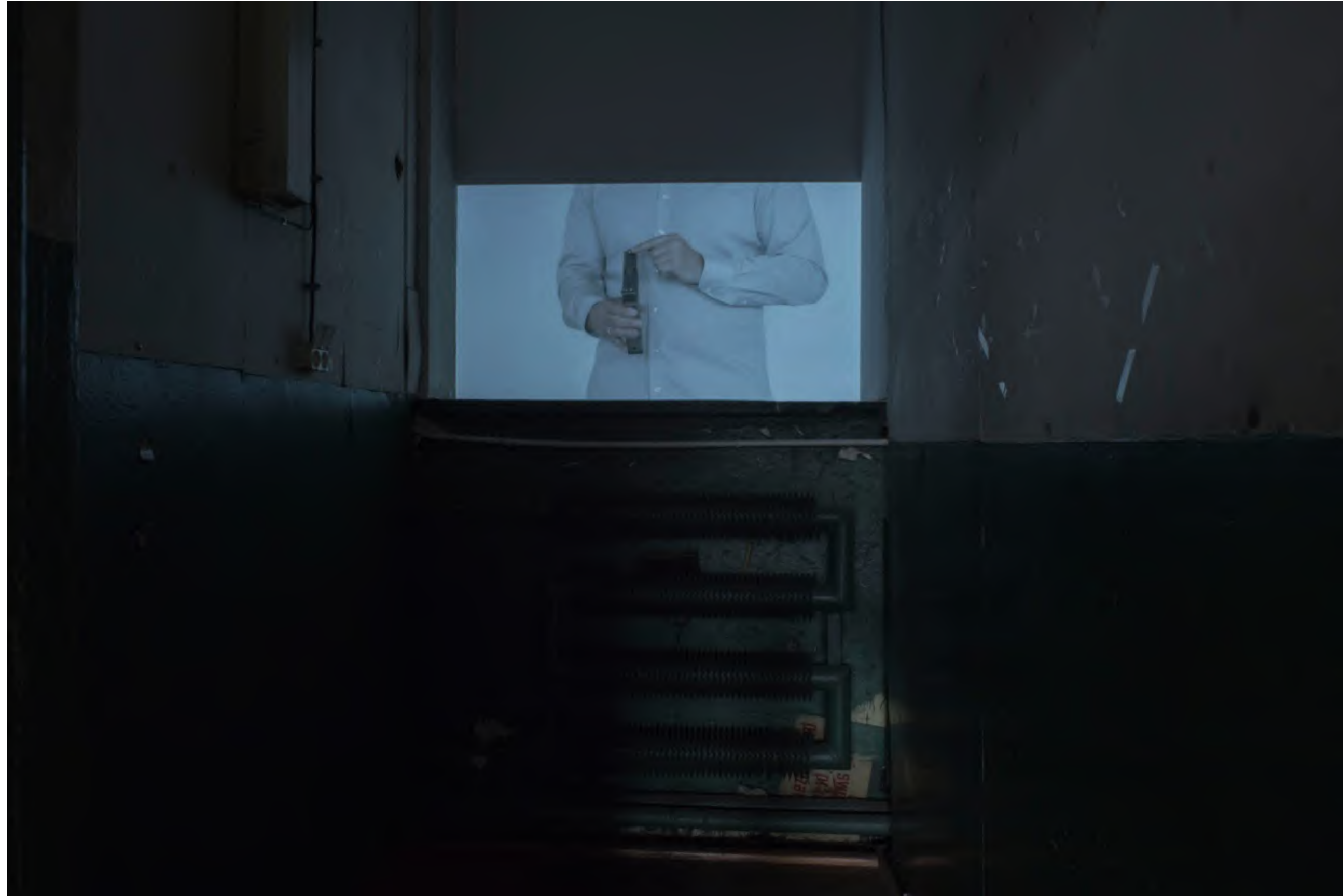
Potentiality of an incident, 2017, installation view, bus depot on Włociańska street, Warsaw