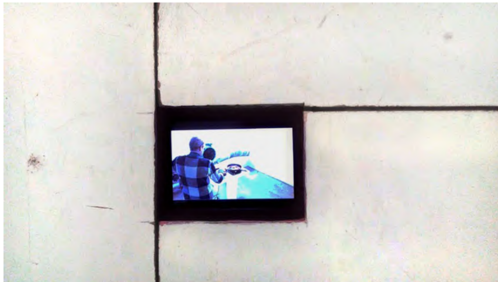
Klimawechsel, 2016, stills from the video documentation

The concept of climate in museums is particularly significant. The basic preventive action, providing protection of collections, is to control the microclimate parameters inside the building. The microclimate is, therefore, part of the museum's structure. Klimawechsel (climate change) is the injection of Wola's climate into the walls of the museum. Imperceptibly generated, the smell of the local specialty - fried chicken liver - is pumped into the ventilation system of the museum. The work circulates inside the building's structure.