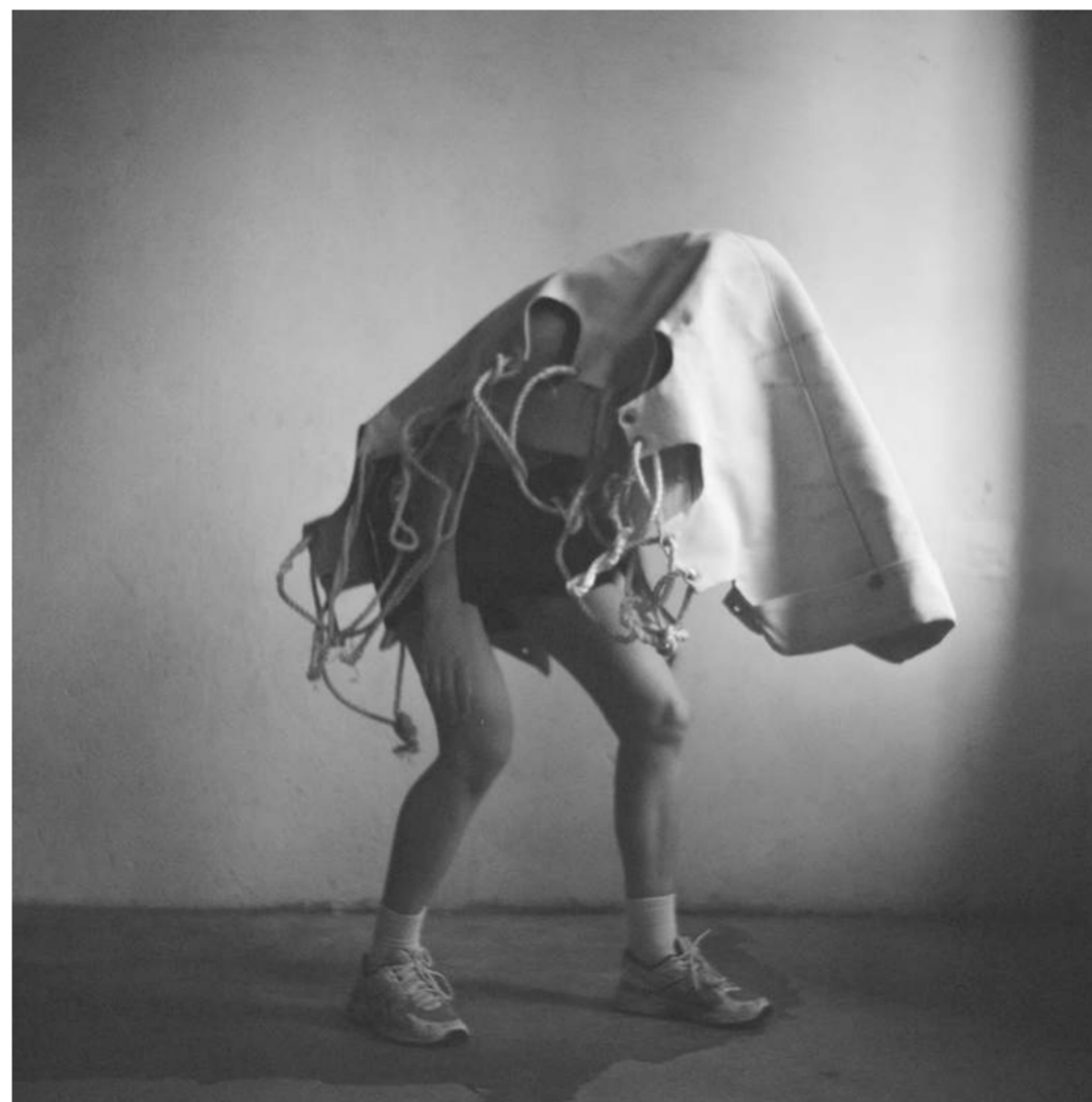
Tanatobjects, 2024, medium format photograph, Pigment ink print on Moab Entrada Natural Rag 300gsm