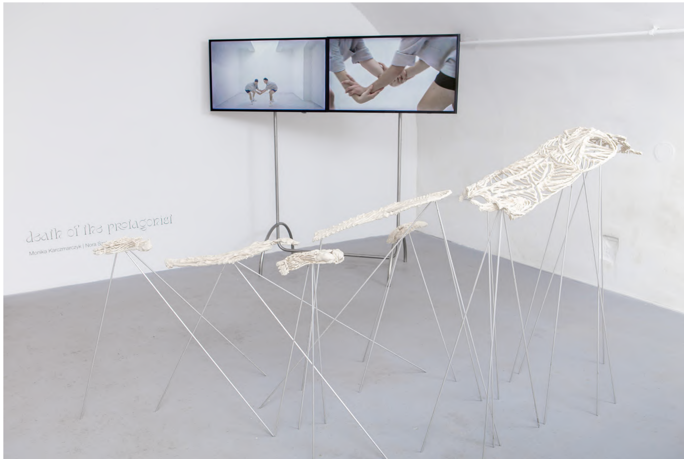
Death of the protagonist, 2023, Pince gallery, Budapest, exhibition view