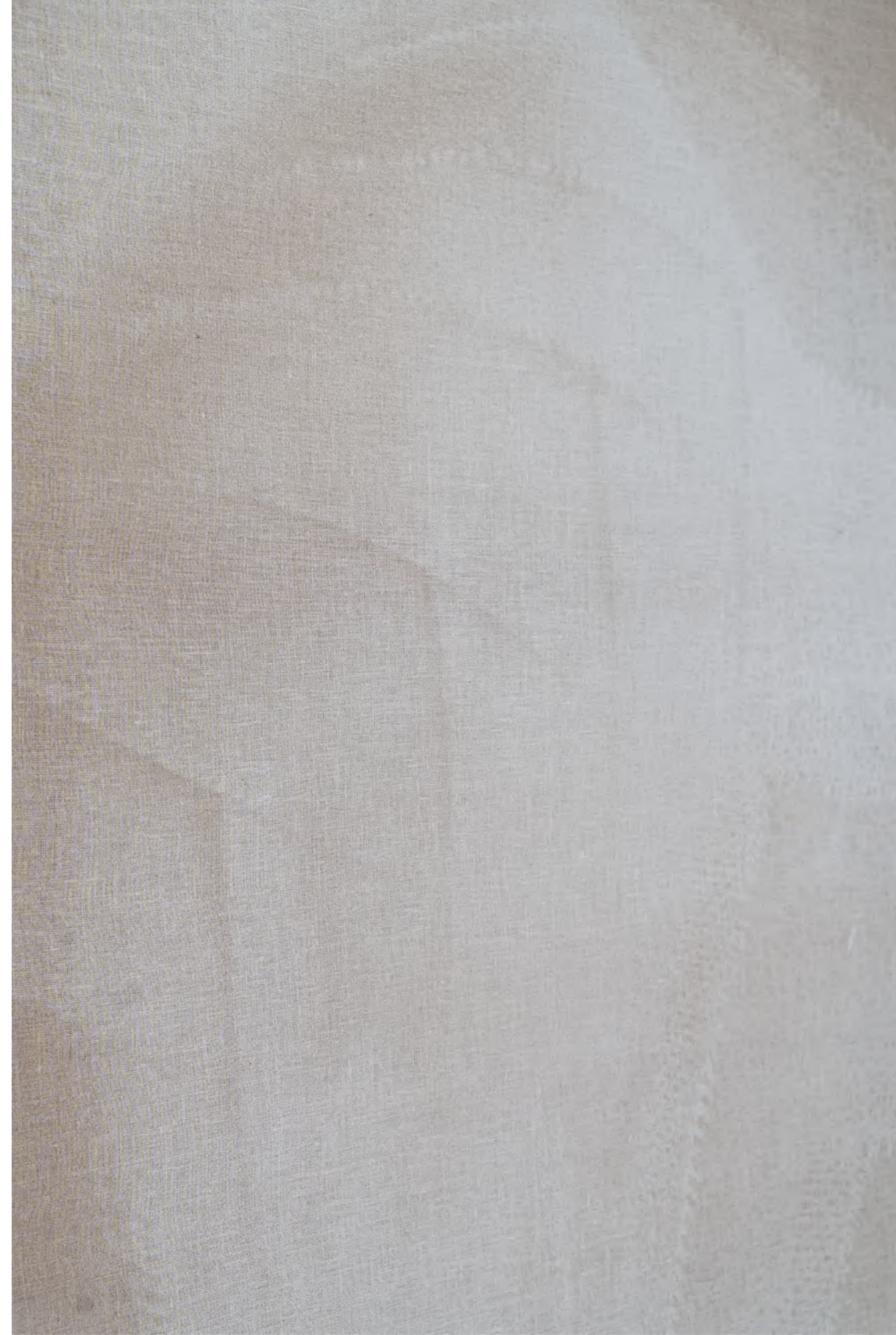
Screen print on canvas, 70x120cm, 2024