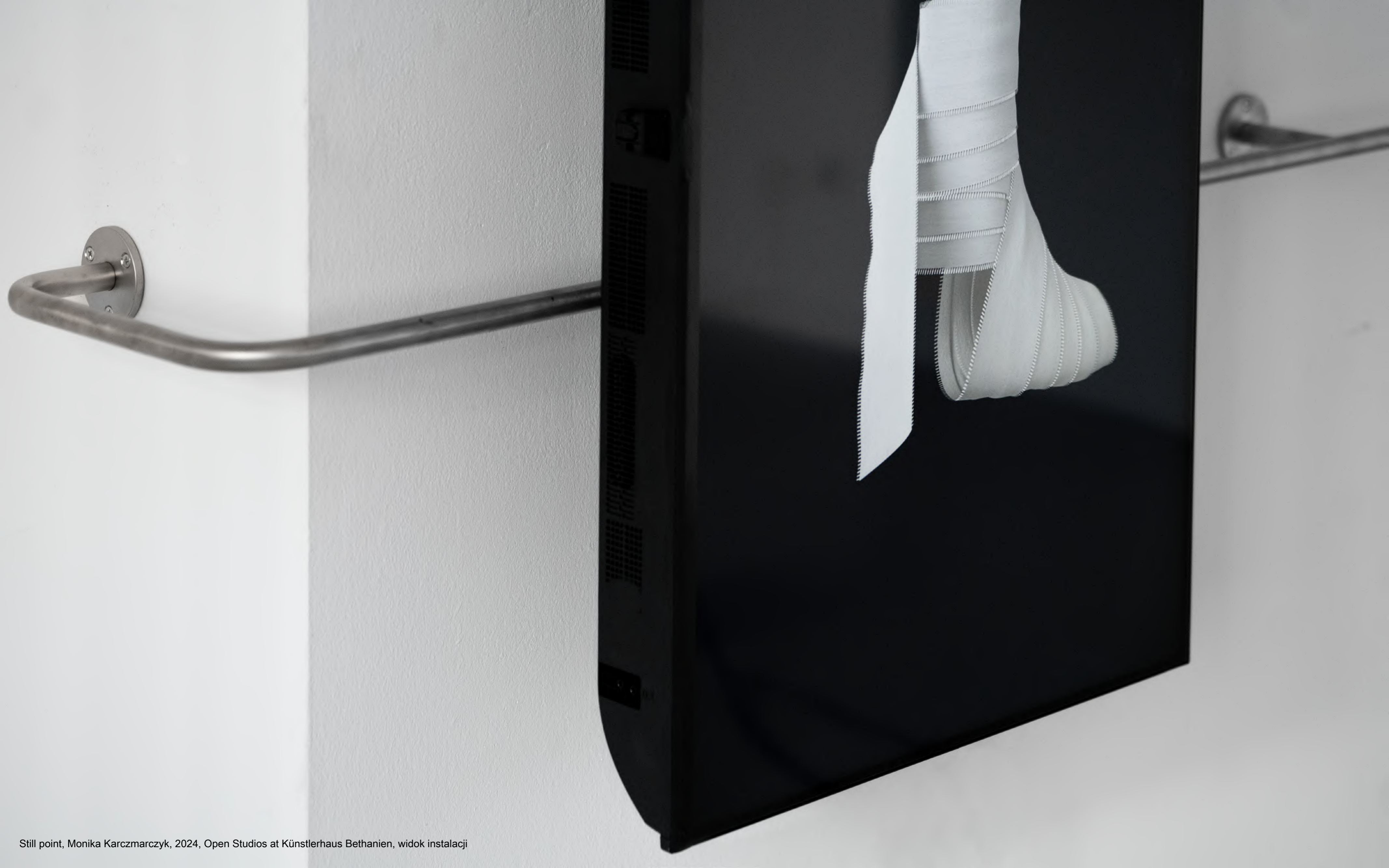
Still point, Monika Karczmarczyk, 2024, Open Studios at Künstlerhaus Bethanien, widok instalacji