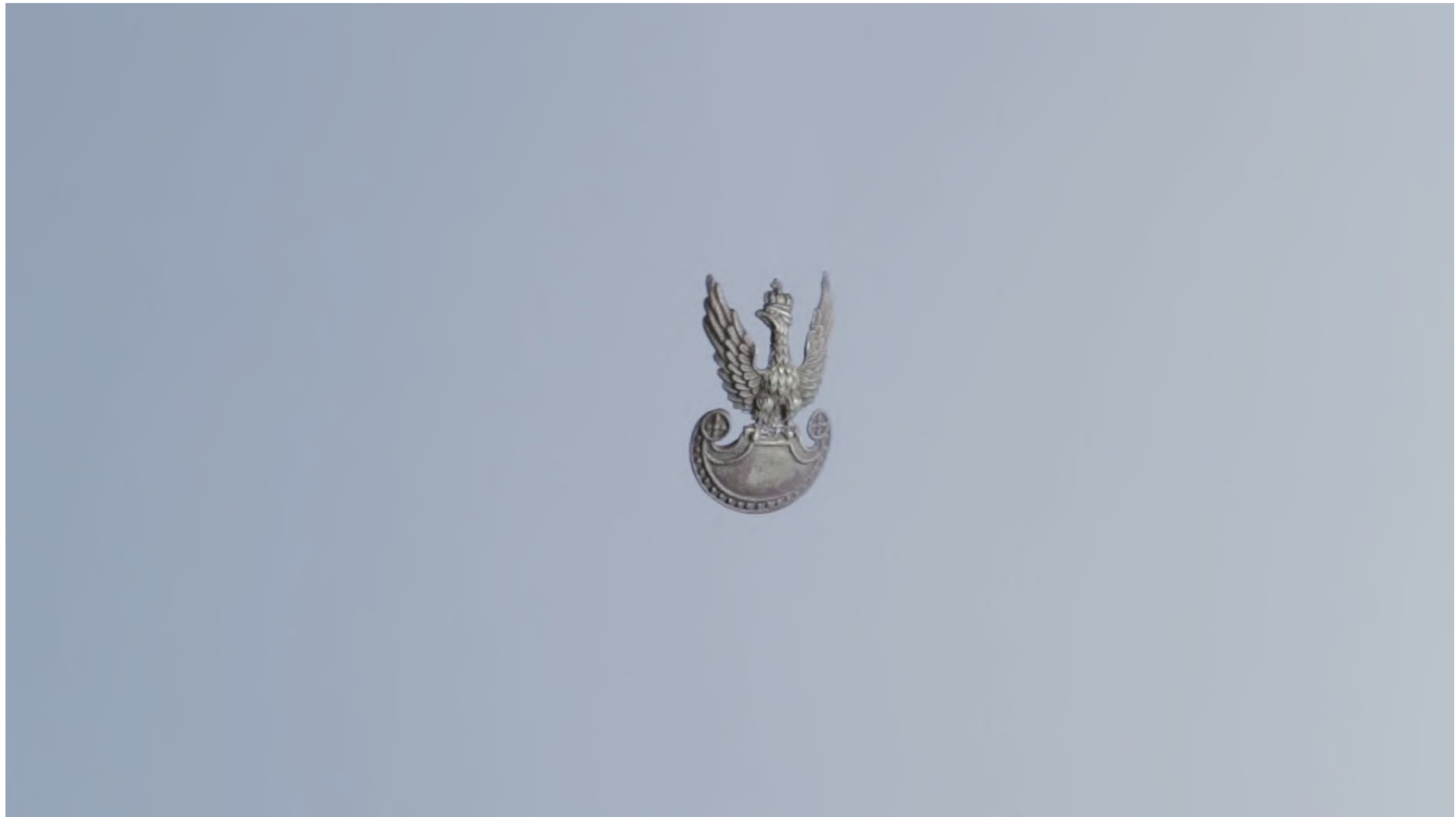
Orzełek, 2018, still from the video, 00:13:12 (loop), https://vimeo.com/272346285

Many of the Łomża eagles were created as replicas or interpretations of earlier, iconic designs, raising questions about authenticity and the transmission of cultural heritage.