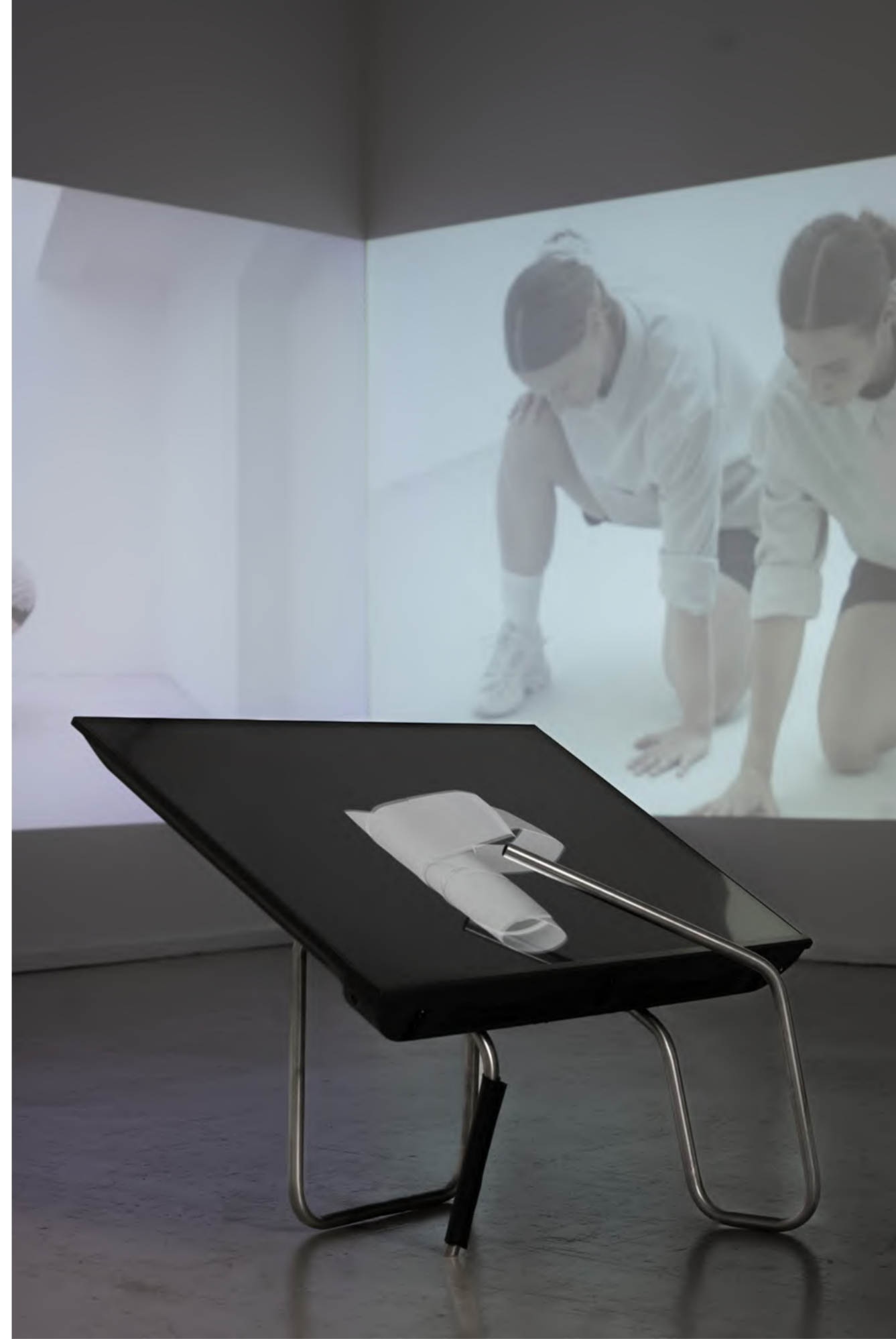
Open studios at Künstlerhaus Bethanien, 2024, exhibition view