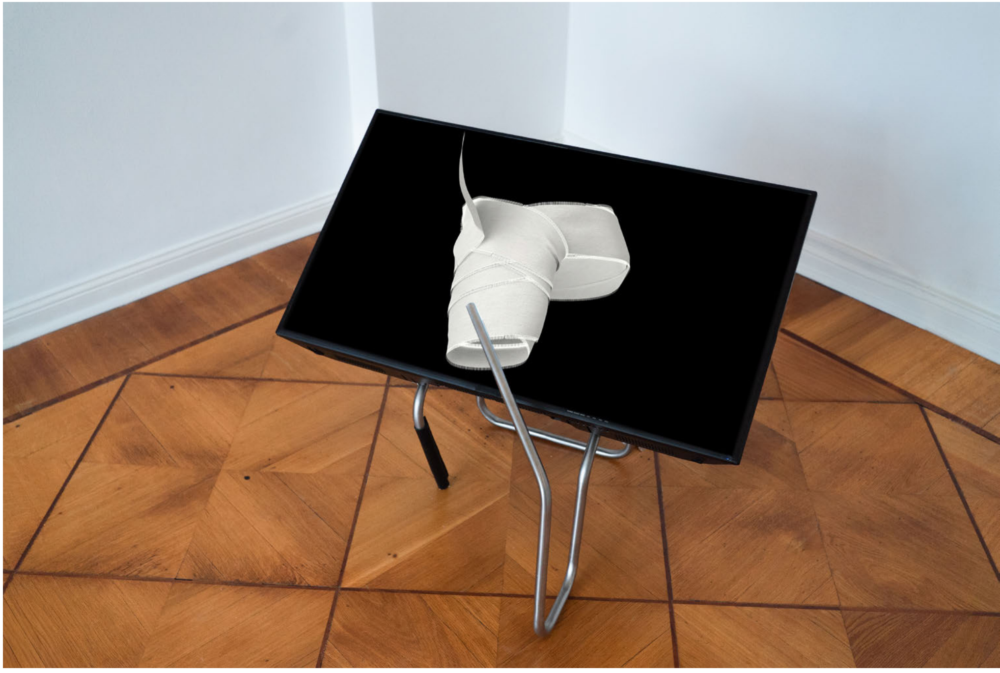
Young Fresh Different, Zilberman Gallery, 2025, exhibition view