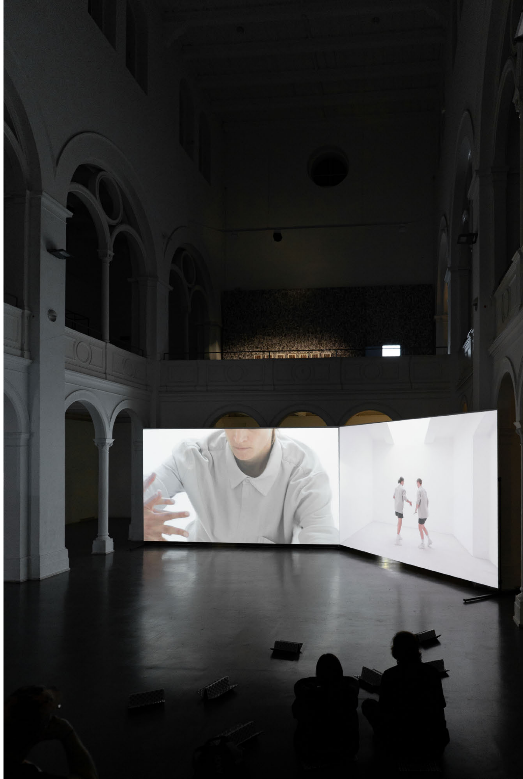
Pas de deux, trois, quatre..., 2025, Kunstquartier Bethanien Berlin, Exhibition view