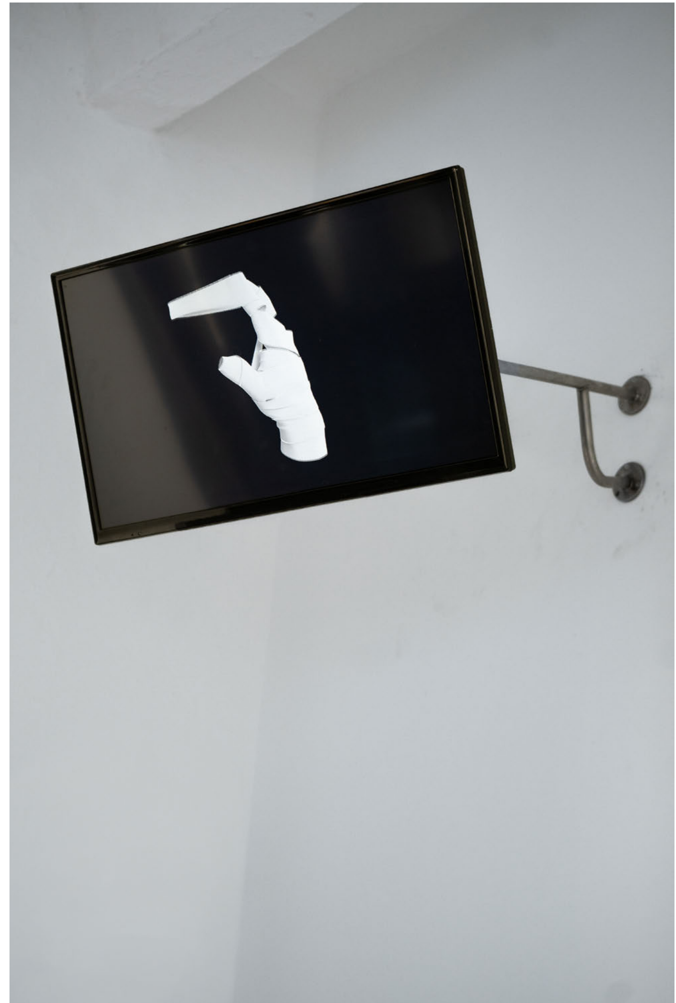
Open studios at Künstlerhaus Bethanien, 2024, exhibition view