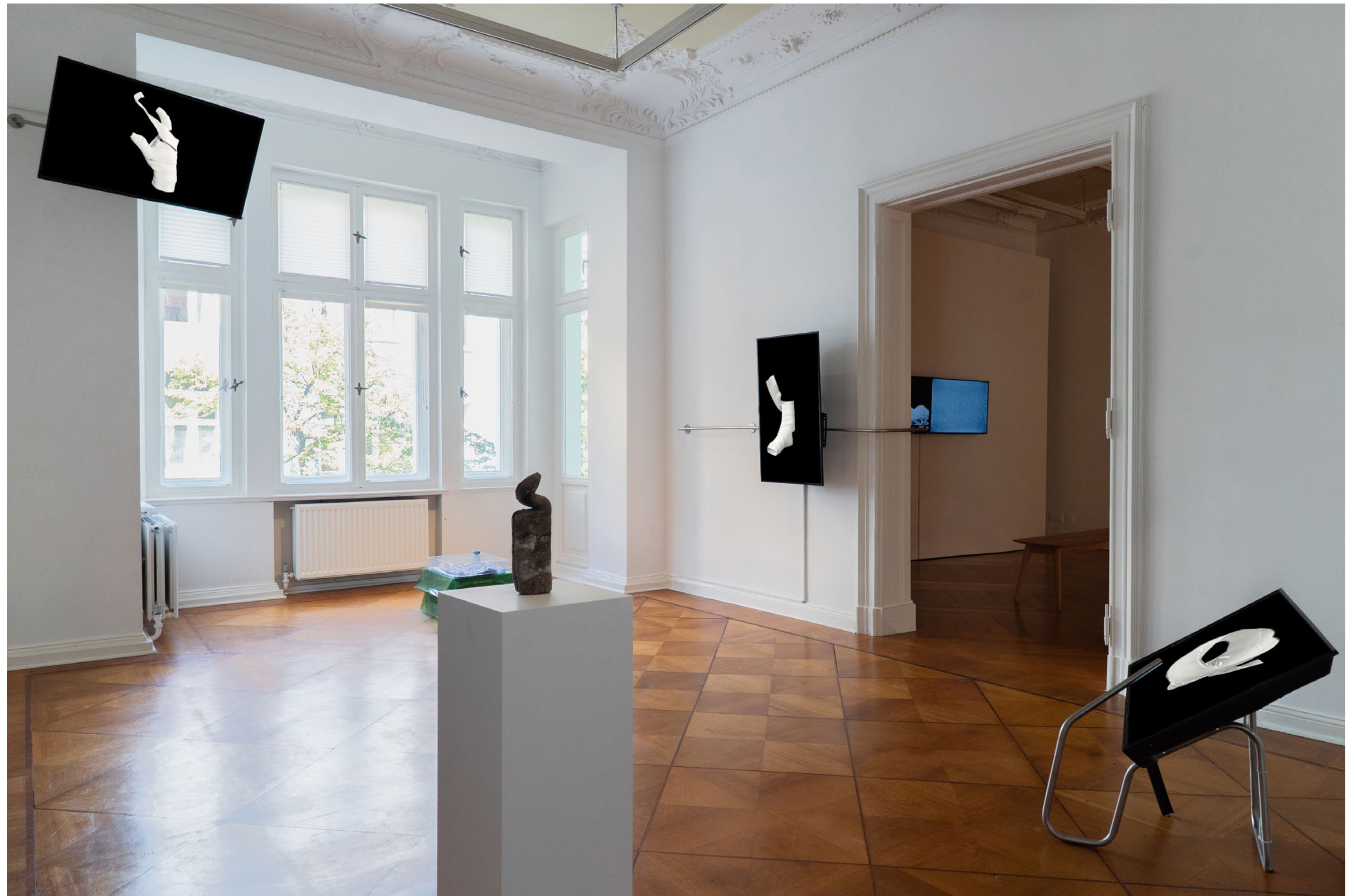
Young Fresh Different, Zilberman Gallery, 2025, exhibition view