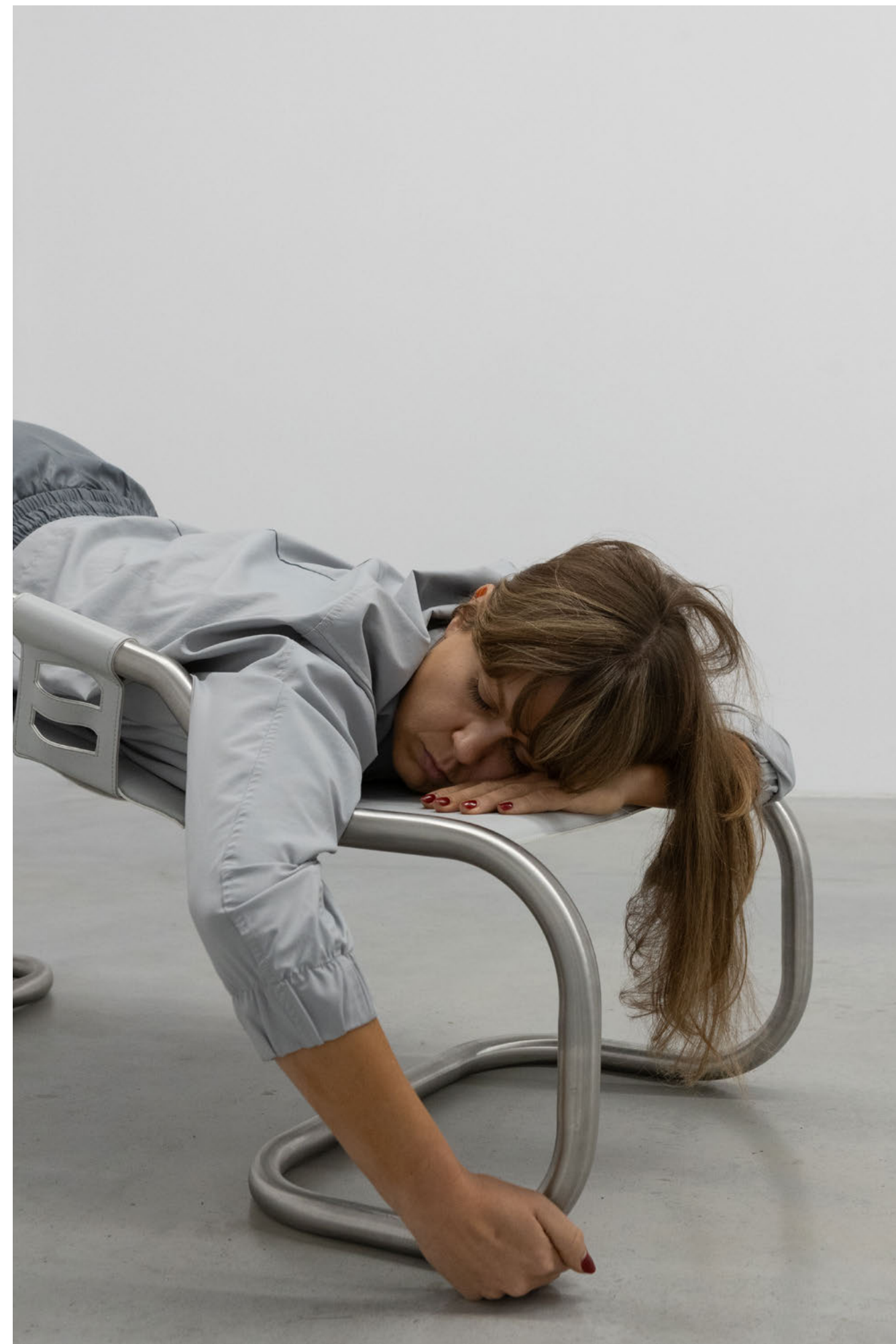
So relax, ghostly, dreamy bodies, and dream, 2025, Stainless steel, imitation leather