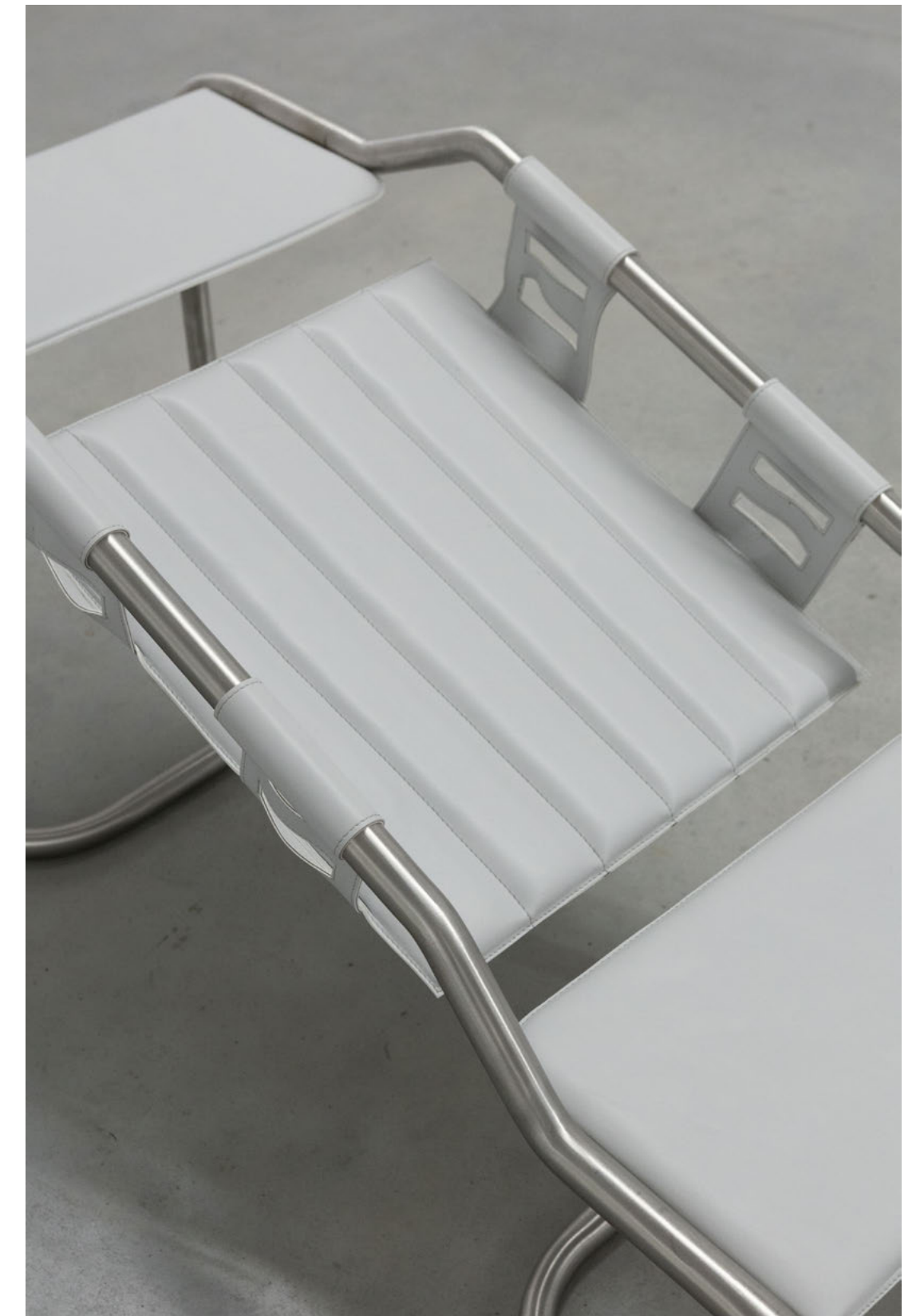
So relax, ghostly, dreamy bodies, and dream, 2025, Stainless steel, imitation leather