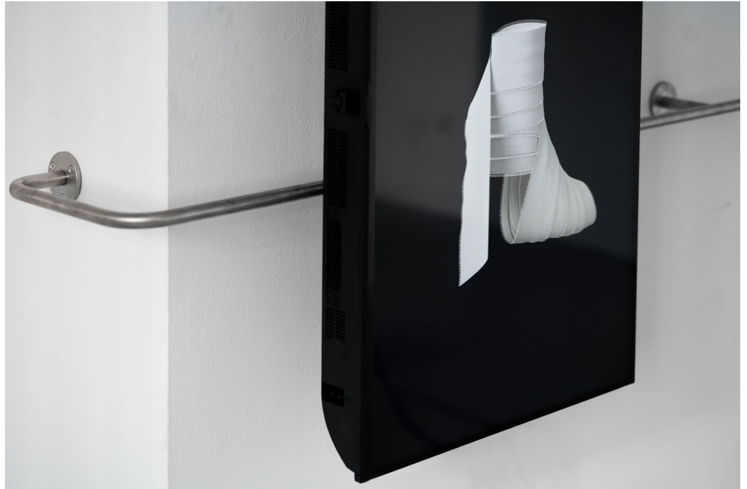
Open studios at Künstlerhaus Bethanien, 2024, exhibition view