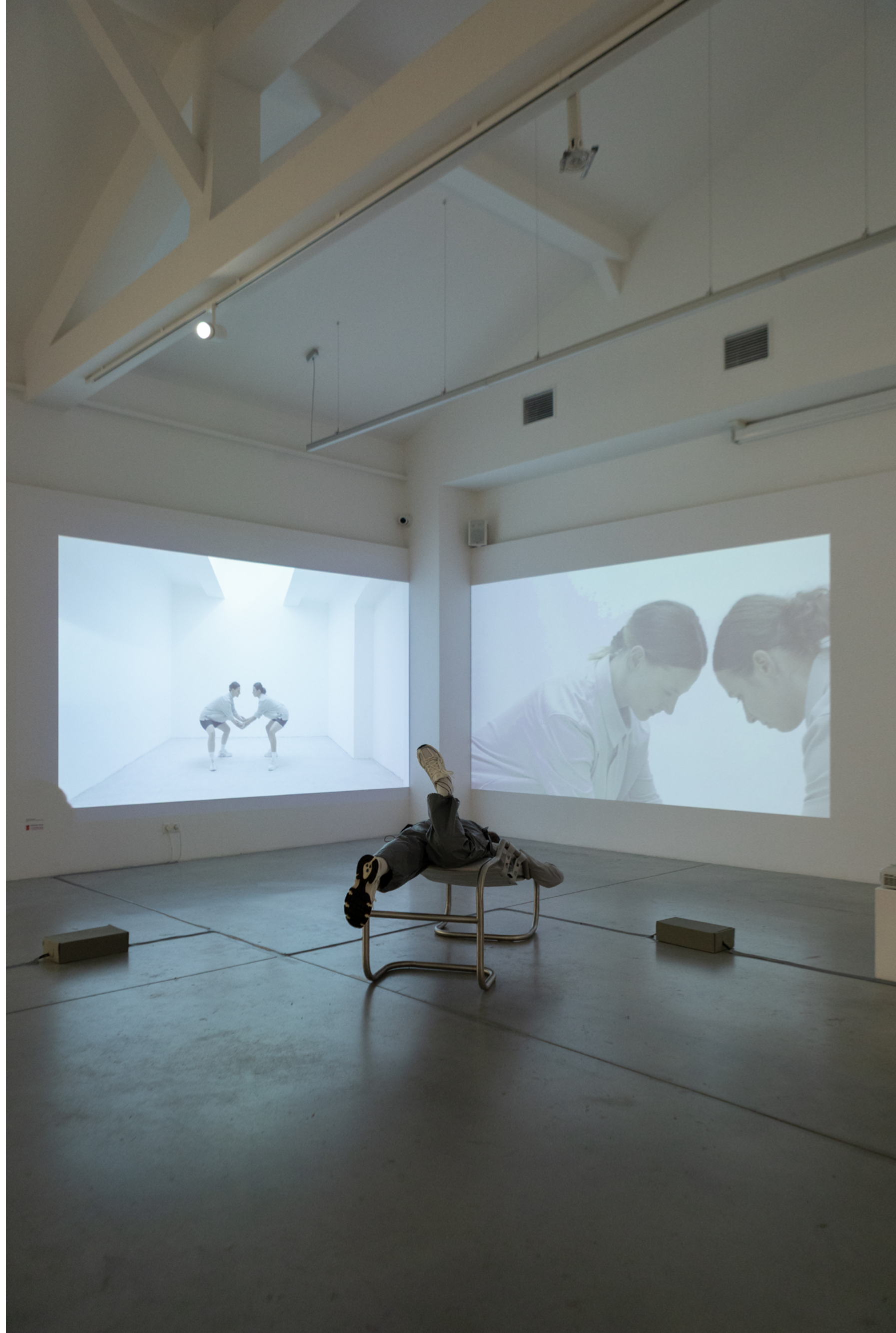
So relax, ghostly, dreamy bodies, and dream, 2025, BWA Ostrowiec Świętokrzyski Berlin, Exhibition view