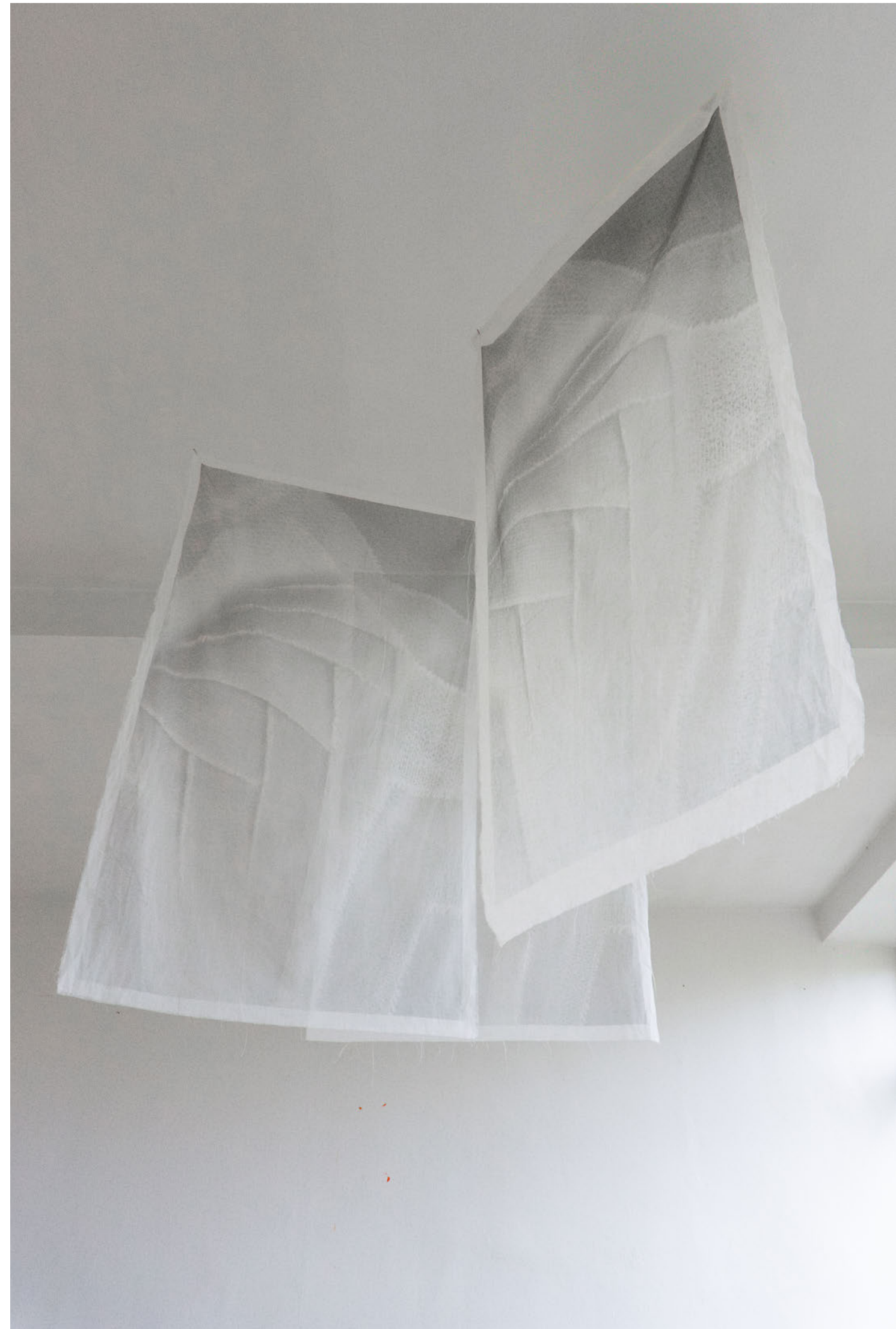
Screen print on canvas, 70x120cm, 2025, installation view