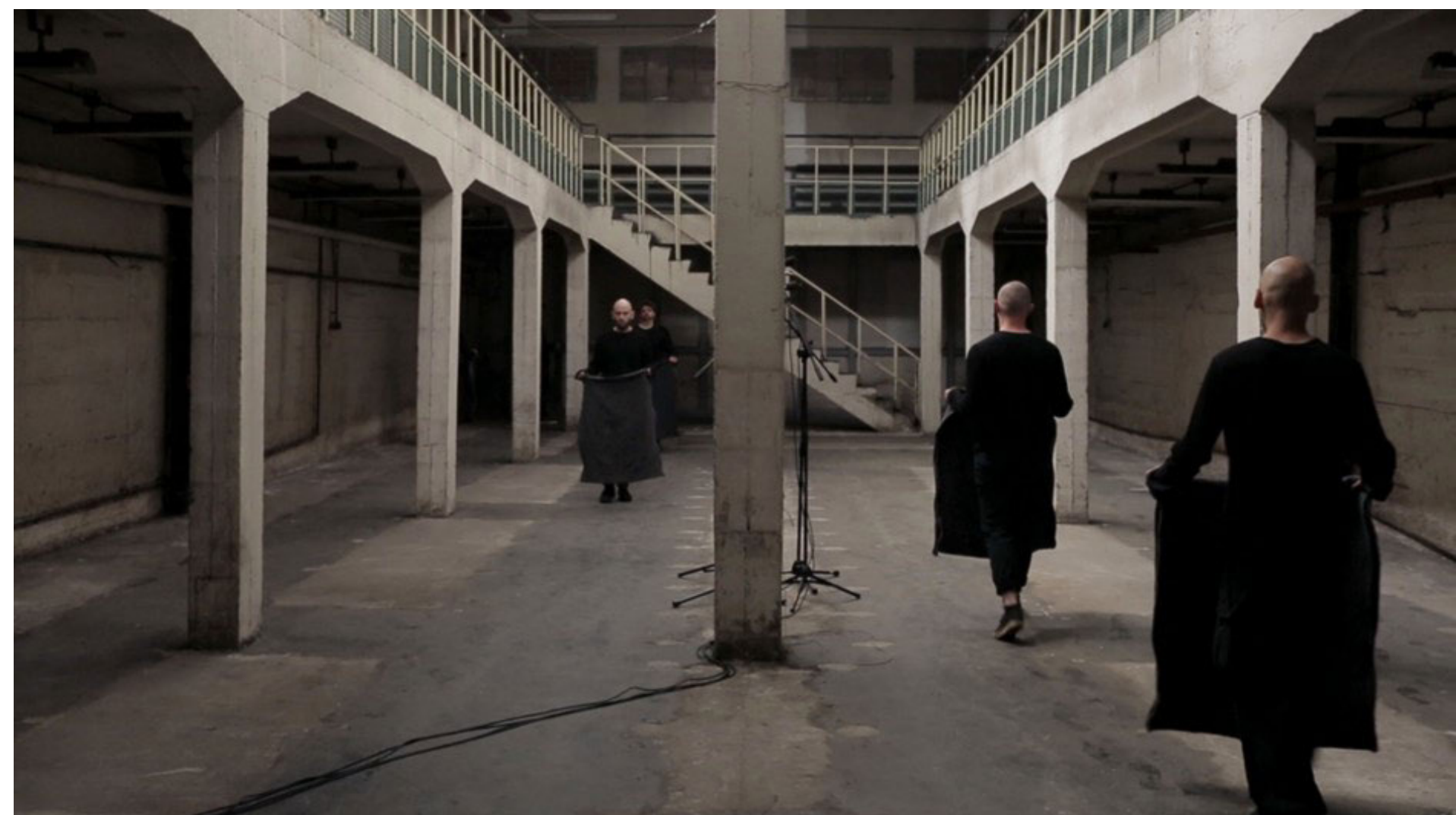
The order, 2017 stills from the video, https://vimeo.com/254704005